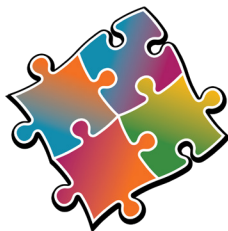
AuSM CONNECTIONS Jigsaw Puzzle Competition

A new fundraiser in 2018, the AuSM Connections Jigsaw Puzzle Competition brought together individuals, families, and the general community for a friendly competition for fastest puzzle completion time. More than 60 individual and family teams met at Mall of America to have fun and create puzzles in support of AuSM programs and services.